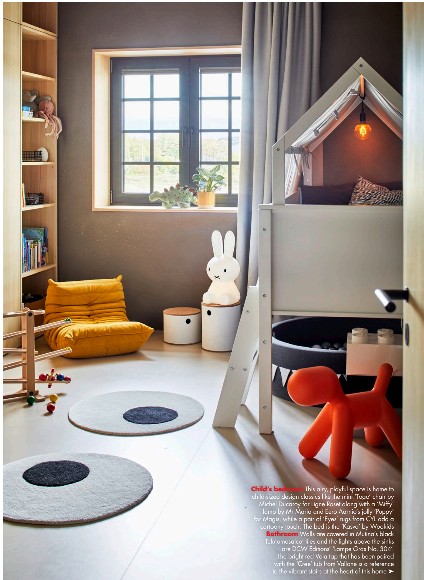
Child's bedroom This airy, playful space is home to child-sized design classics like the mini 'Togo' chair by Michel Ducaroy for Ligne Roset along with a 'Miffy' lamp by Mr Maria and Eero Aarnio's jolly 'Puppy' for Magis, while a pair of 'Eyes' rugs from CYL add a cartoony touch. The bed is the 'Kasva' by Wookids Bathroom Walls are covered in Mutina's black 'Teknomosaico' tiles and the lights above the sinks are DCW Editions' 'Lampe Gras No. 304'. The bright-red Vola tap that has been paired with the 'Cree' tub from Vallone is a reference to the vibrant stairs at the heart of this home ▶